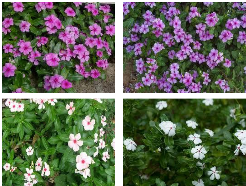
Fig. 1: Images of different types of flowers of Catharanthus roseus

Table 1(a) represents taxonomic position and table 1 (b) represents various regional name by which C. roseus is known in different languages.