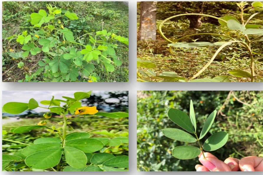
Figure 1: Parts of Cassia tora Linn.: Fruit, Flowers, and Leaves